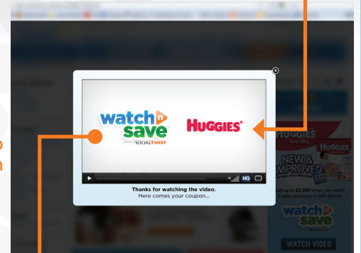
Watch video to get coupon