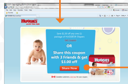
Get coupon or increase coupon value by sharing video